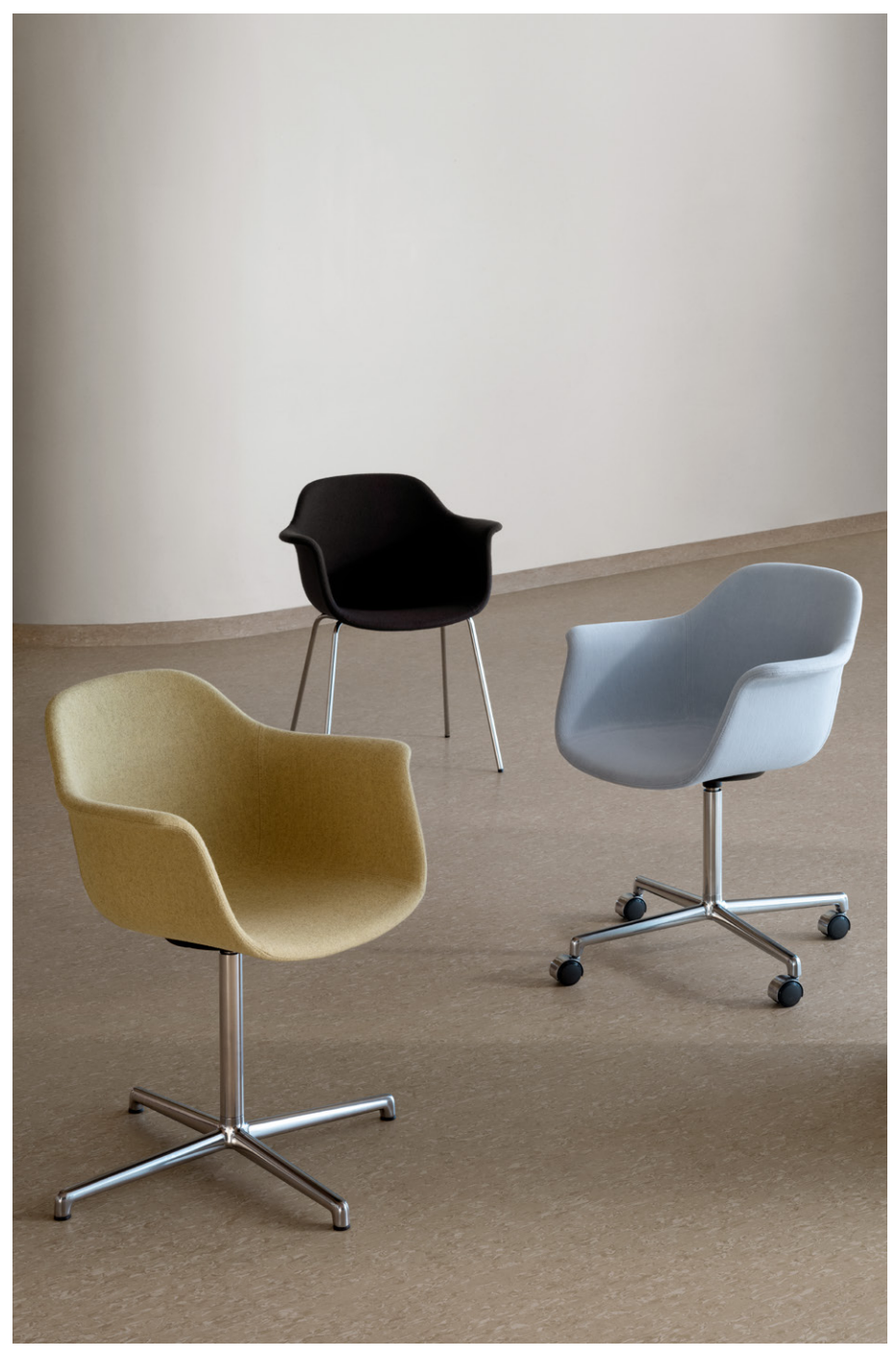
GRADE PLUS Armchair